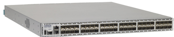
Figure 1: Arista 7148SX Switch

Arista 7148SX is a 48-port Layer 2/3 switch. The 7148SX offers density of 48 ports in a single rack unit. The switch uses Fulcrum FM4000 ASICs to provide non-blocking performance and low latency for both layer 2 and 3. Despite the small form factor, the device offers datacenter-class resiliency with fully redundant & individually hot-swappable fans and power supplies.